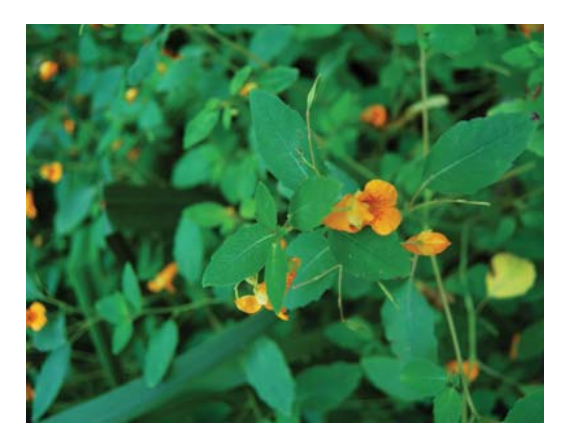
Figure 3. Jewelweed.

Your job is to use the scientific method to plan an experiment to determine if jewelweed is an effective treatment.